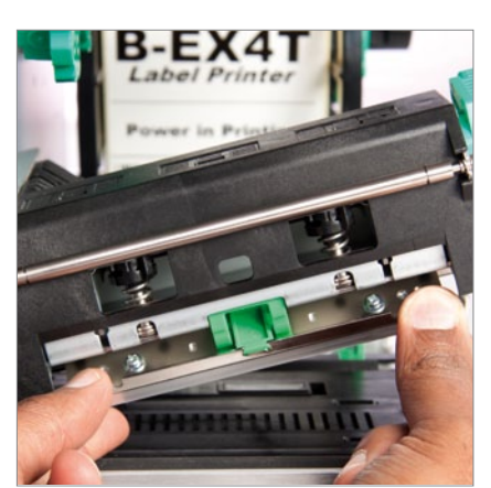
Snap-in printhead reduces maintenance downtime to a minimum